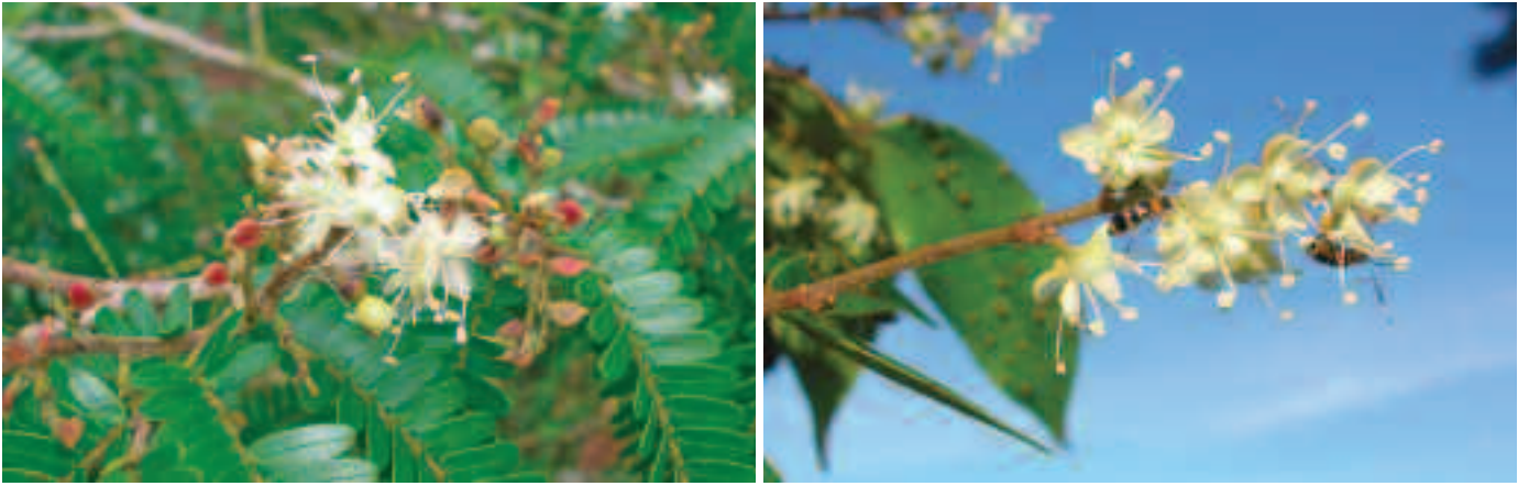
Fig. 3: Flowers of Peltogyne purpurea (left) and Copaifera camibar (right) (Caesalpiniaceae, Fabaceae), an example of the group of species that produce flowers during the middle of the rainy season and set fruits during the dry season.

serve any species which require more than a year for fruit maturation, which is commonplace in tropical dry forest tree species (FRANKIE et al. 1974).