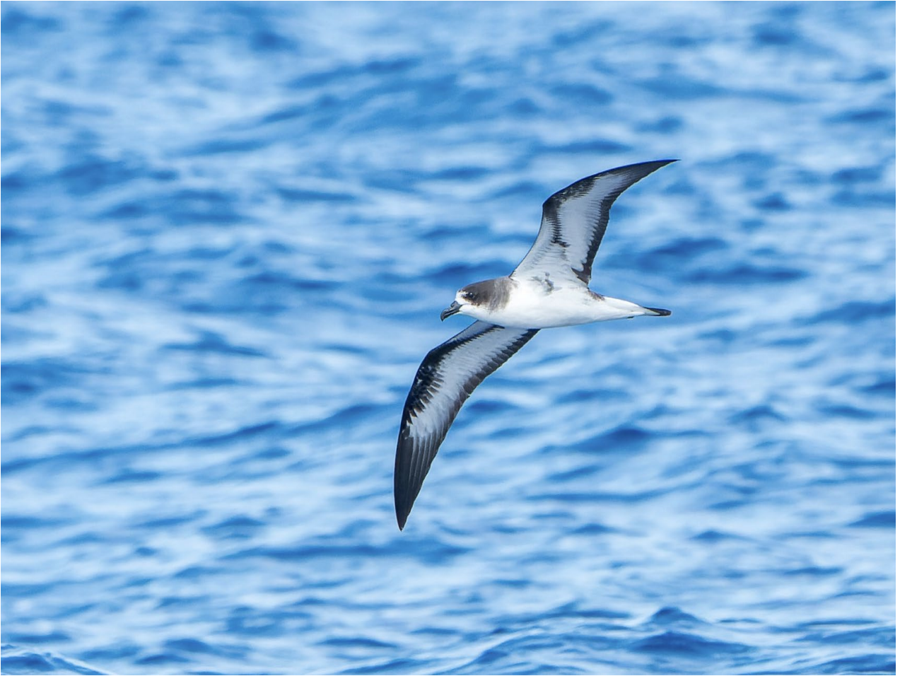
Figure 3. Galapagos Petrel Pterodroma phaeopygia , observed on January 11, 2024, in the craters area in front of the Nicoya Peninsula.