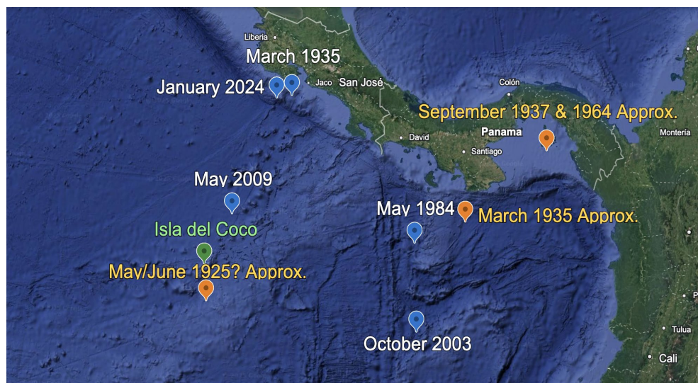
Figure 1. Dates and locations of reports of Pterodroma phaeopygia in Central American waters. Reports in orange are approximate locations. Isla del Coco is marked in green.

Young, B. E. Y., and J. R. Zook. (2016). Observation Frequency and Seasonality of Marine Birds off the Pacific Coast of Costa Rica. Revista de Biología Tropical , 64(S1), 235–248.