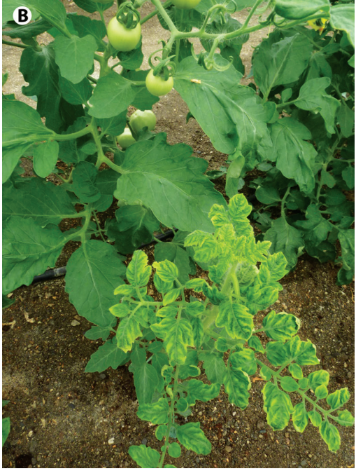
Fig. 1. Tomato plants infected with the monopartite begomovirus Tomato yellow leaf curl virus (TYLCV) showing symptoms of curling and distortion in leaves (A) and of chlorosis and stunting of the plant (B).

After the long-distance spread of SLCuV from the NW to the OW, WmCSV movement between countries of the Middle East is likely occurring through movement of viruliferous whiteflies and infected plant materials. Similar to these two viruses, recent long-distance movement has occurred for the OW bipartite begomovirus ToLCNDV from the Indian subcontinent to the Western Mediterranean basin, with subsequent emergence in neighboring