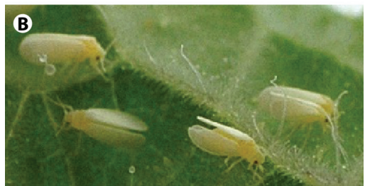
Fig. 2. An infestation of Bemisia tabaci adults on eggplant (A), as well as a close-up of some individuals inserting their stylets into a tomato leaf (B).