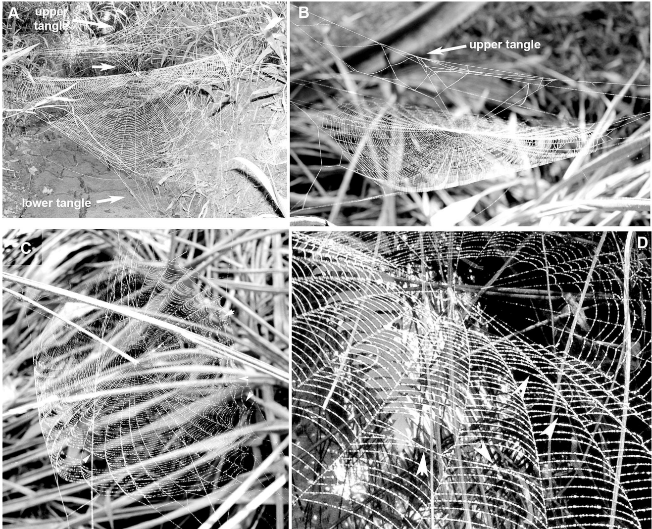
Figure 1.—Web characteristics of young Leucauge argyra . A. Web of a small spiderling with relatively dense tangle and numerous threads connecting the tangle to the hub of the orb web below. Part of the lower tangle with some threads attached to the substrate below is shown. B. Web of an older instar spiderling with a reduced tangle and few threads connecting the tangle to the hub of the orb web below. C. Web with radii and spiral threads deformed by a weak breeze in the field. D. Section of a spiderling web showing some spiral threads collapsed (white arrows).

Webs of L. argyra show clear ontogenetic changes. Adult females spin typical orb webs in horizontal planes ( 0\text{--}20^\circ ) without additional silk structures. They build them in open spaces, using exposed twigs and leaves on the herbaceous layer to attach the anchor threads. In contrast, early instar spiderlings (first instar out of the egg sac, recognized by their whitish abdomens, to possibly fourth instars, based on size) spin tangle structures above the horizontal orb webs (Figs. 1A, B). The tangle varies from a relatively dense, narrow tangle, to a few threads just a few mm above the orb. Several threads connect the hub to the tangle above. The tangle above the orb seems to be denser in younger spiderlings (Fig. 1A). In some webs, there is also a tangle of sparse threads that connect the web frame with the substrate below (Fig. 1A). Webs of early instars are constructed within dense herbaceous vegetation, often occupying small spaces among grass leaves.