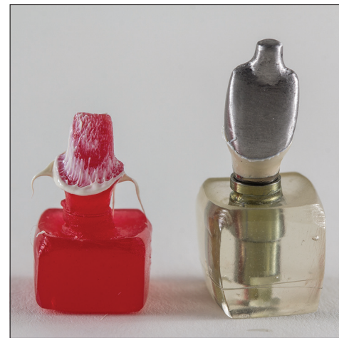
Figure 1: Preseating cementation protocol on abutment replica

After the coping was positioned on the implant abutment and seated into place, a load of 5 kg was maintained for 5 min. Following this, the cement excess was removed from the margin with a scalpel blade and