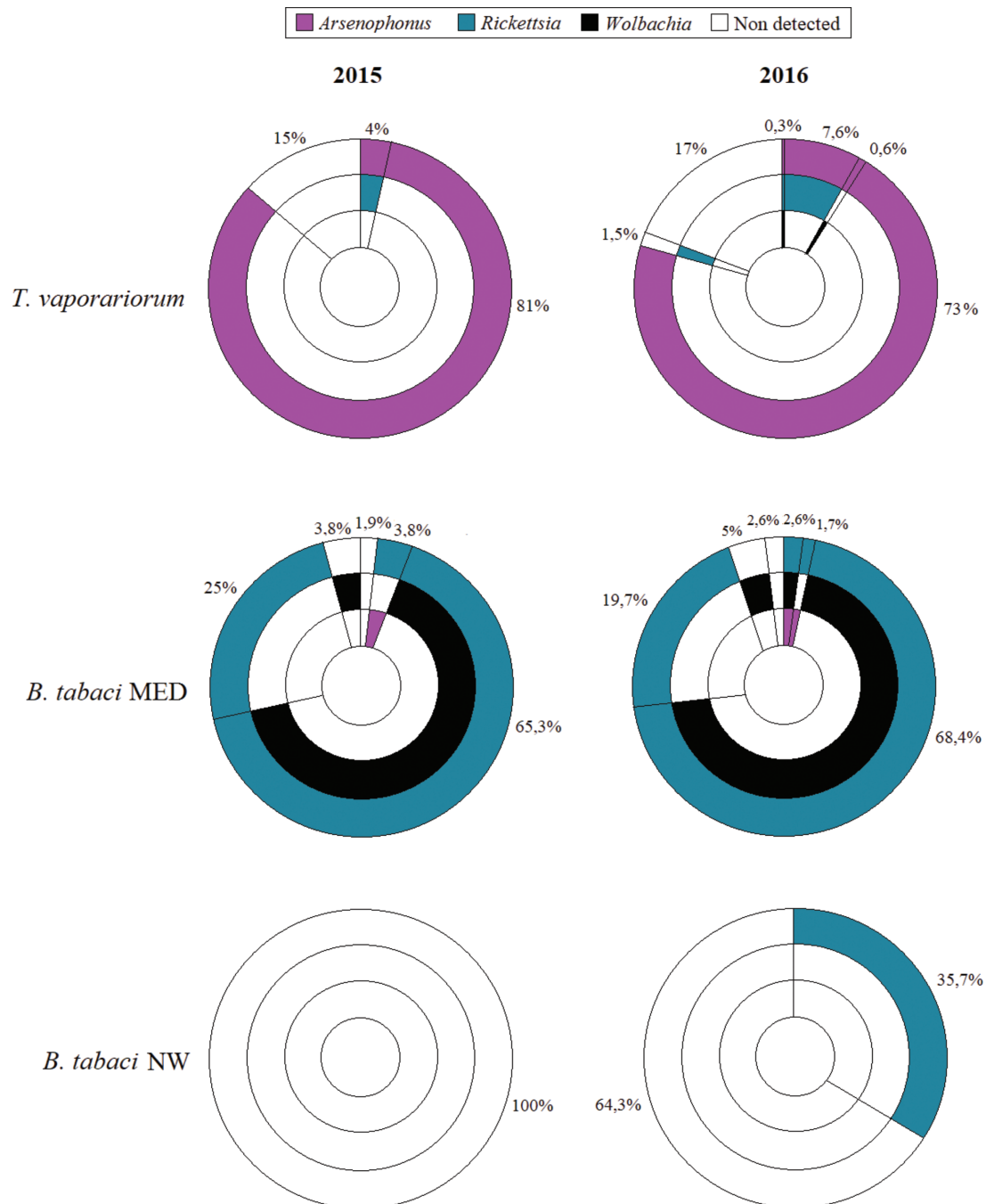
Fig. 3. Abundance of endosymbionts Arsenophonus , Rickettsia and Wolbachia in whitefly species Trialeurodes vaporariorum , Bemisia tabaci MED and B. tabaci NW collected in tomato fields in 2015 and 2016.

The presence of three endosymbionts was confirmed in whiteflies collected in tomato fields in the main areas of tomato production in the country. Regarding the endosymbionts not considered in this