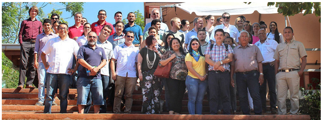
Group photo with the participants of the workshop “Green adaptation strategies for water security in the Central American dry corridor” organised by researchers from Universidad Nacional Costa Rica and Technische Universität Dresden, Germany, in Nicoya, Guanacaste peninsula, on 26 March 2019.