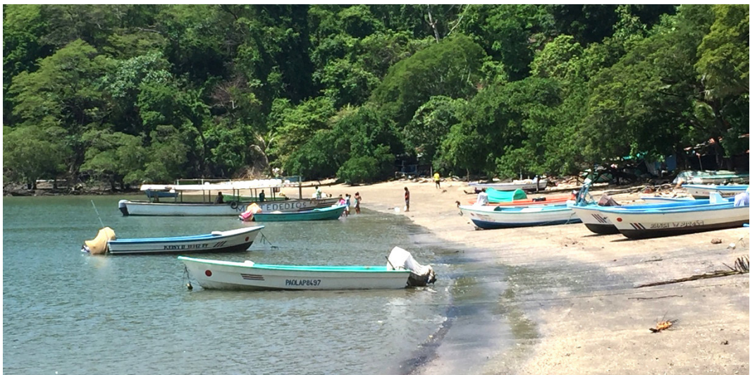
During the dry season, the local communities living on the islands of the Nicoya peninsula are severely affected by freshwater scarcity

Costa Rica is a water-blessed country with abundant rainfalls oscillating annually between 1,300 and 7,500 mm. A full set of measures and policies made Costa Rica globally famous for the success of its environmental protection efforts. This ecological commitment ranked the country on top of Latin American and Caribbean countries on the protection of human health and ecosystems. In 2015, the country also achieved 99% of its energy generation from renewable sources, an important milestone in its plan to go carbon neutral by 2021. But this highly privileged status on environmental protection received serious challenges when regarded from the perspective of sustainable water management. One of the main issues of concern relates to the high rainfall seasonality in the North Pacific Region, which increases dramatically the pressure on available freshwater resources. While some issues are currently being addressed at national level, at regional level the country is facing increased pressure from pollution of surface water, from seasonal water scarcity (for example in the Pacific insular communities) and from saltwater intrusion in north-western coastal areas such as Guanacaste province, which are exposed to an increased urban development and concentrated tourism.