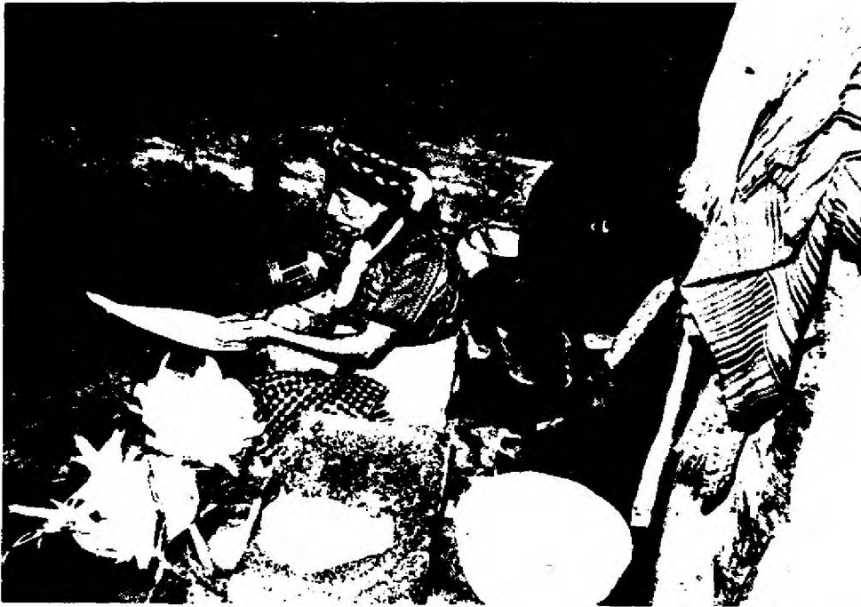
Figure 2. A Cakchiquel mother and young child from Santa María Cauqué, Guatemala. The mother prepares tortillas from corn dough while nursing. A large earthen jar stores the all-purpose water.